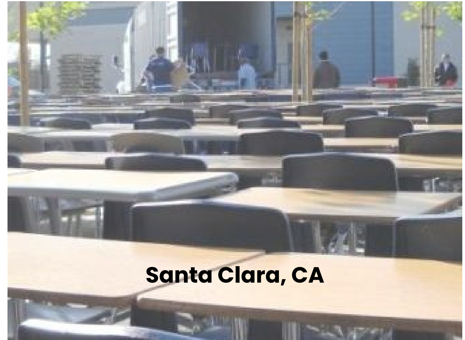
Santa Clara, CA

If you can imagine it being used again, we can use it.