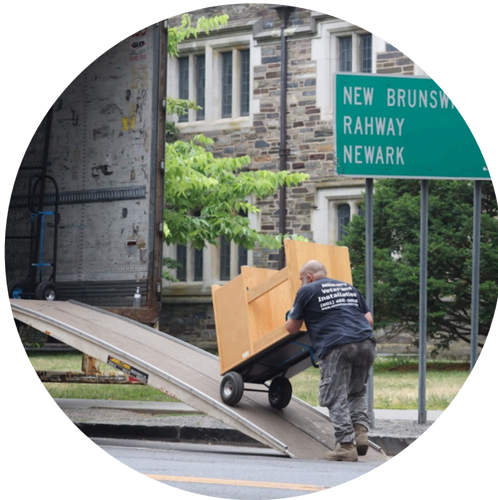
Loading Furniture for Shipment (Princeton University)