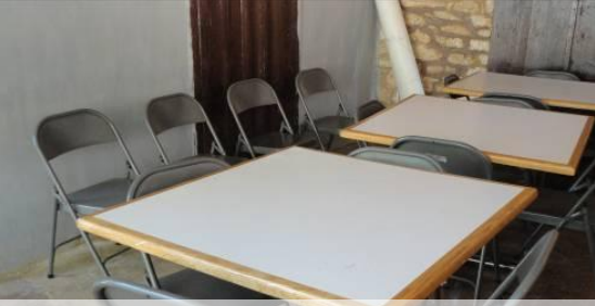
"New" cafeteria furniture at the Orphelinat Les Amis de Jesus, outside Port-au-Prince