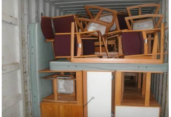
A trailer of Westfield State furniture opened and ready for distribution, Port-au-Prince, Haiti

Summary: Replacing furniture from 75 apartments at Westfield State University, the Massachusetts State College Building Authority asked IRN to manage the removal and match the furnishings with charitable recipients. Through partner Food For The Poor, IRN placed the WSU furniture with orphanages and schools and an urban church in and near Port-au-Prince, Haiti, serving some of the poorest communities in the Americas.