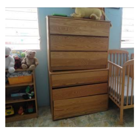
Dressers from Westfield State in a dormitory for infants, Foyer Renmen