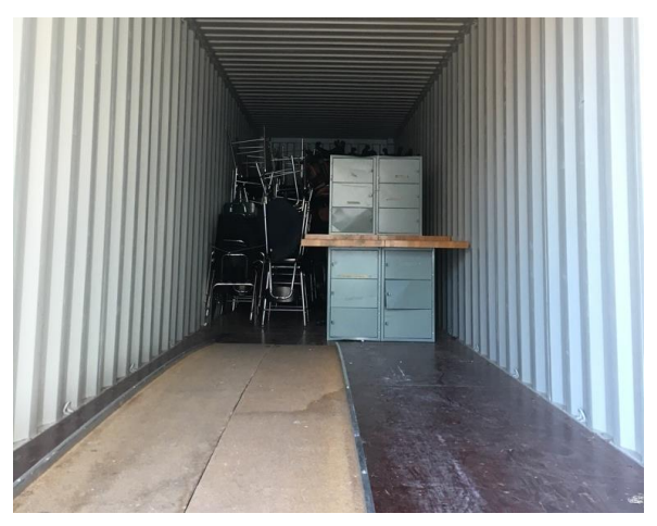
A few of more than 11,000 items from Las Cruces and Santa Fe, NM, provided to students across the U.S. and around the world.

Worth it? Heck, yes. Nearly 2,000 desks, over 1,000 classroom tables, nearly 1,300 bookshelves and storage cabinets, nearly 5,300 student chairs, and some 2,000 other items including teachers desks, lounge and reception area furniture, music stands, cafeteria tables and chairs, and much more. All taken away from American landfills, all now being put to use, helping kids and communities where buying new school furniture isn't an option.