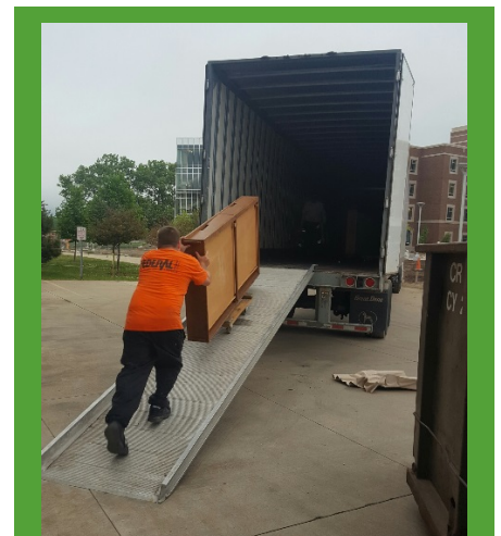
June 2016. This Illinois bed will be delivered to a Habitat for Humanity affiliate in Indiana.

In 2013 IRN found a home for 2,820 pieces of furniture from three Illinois residence halls. That was the first of a series of projects that continue today. Through the beginning of 2018, Illinois has provided nearly 5,500 pieces of usable furniture to nonprofits – more than half a million pounds, filling 33 tractor trailers.