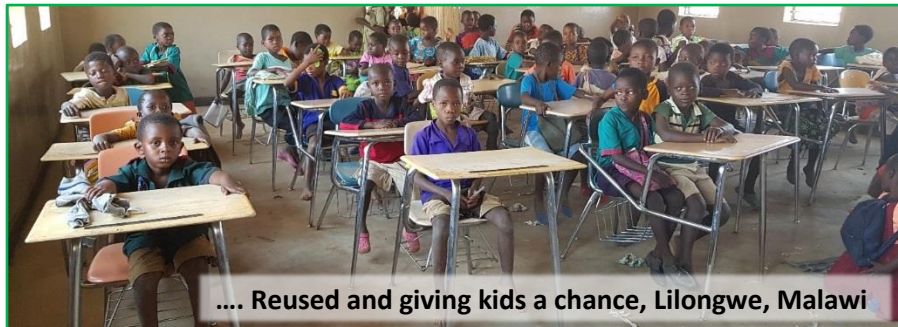
.... Reused and giving kids a chance, Lilongwe, Malawi